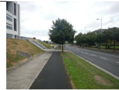
Grass encroaching cycle facilities