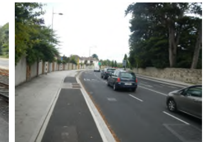
Shrub is encroaching on footpath resulting in pedestrians walking into cycle lane which may result in a cyclists/pedestrian collision. Cut back vegetation.