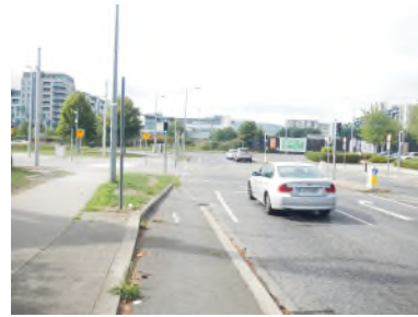
Manholes in cycle lane