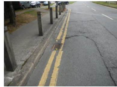
Gullies not flush with the pavement