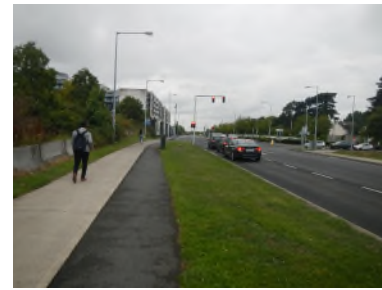
Grass encroaching cycle facilities