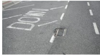
Gullies not flush with the pavement