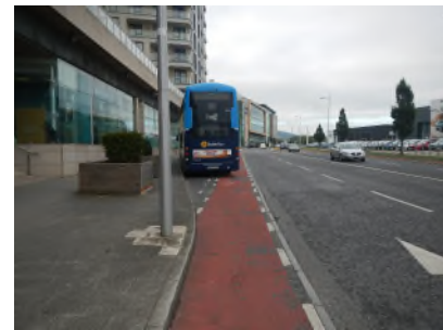
Gullies not flush with the pavement