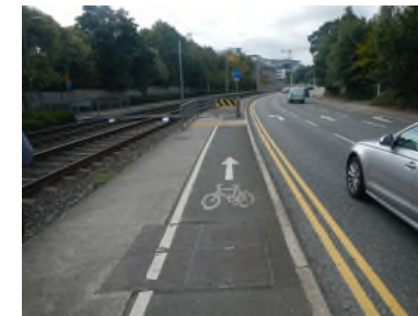
Manholes in cycle lane/track